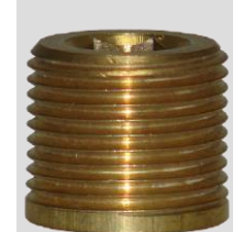
B Type: Internally accessible hexagon recess

Type "A" and "B" Stopping Plugs provide a method of blanking off unused entries in hazardous area approved equipment while ensuring that integrity and Ex approval of the installation is maintained.