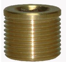
A Type: Externally accessible hexagon recess